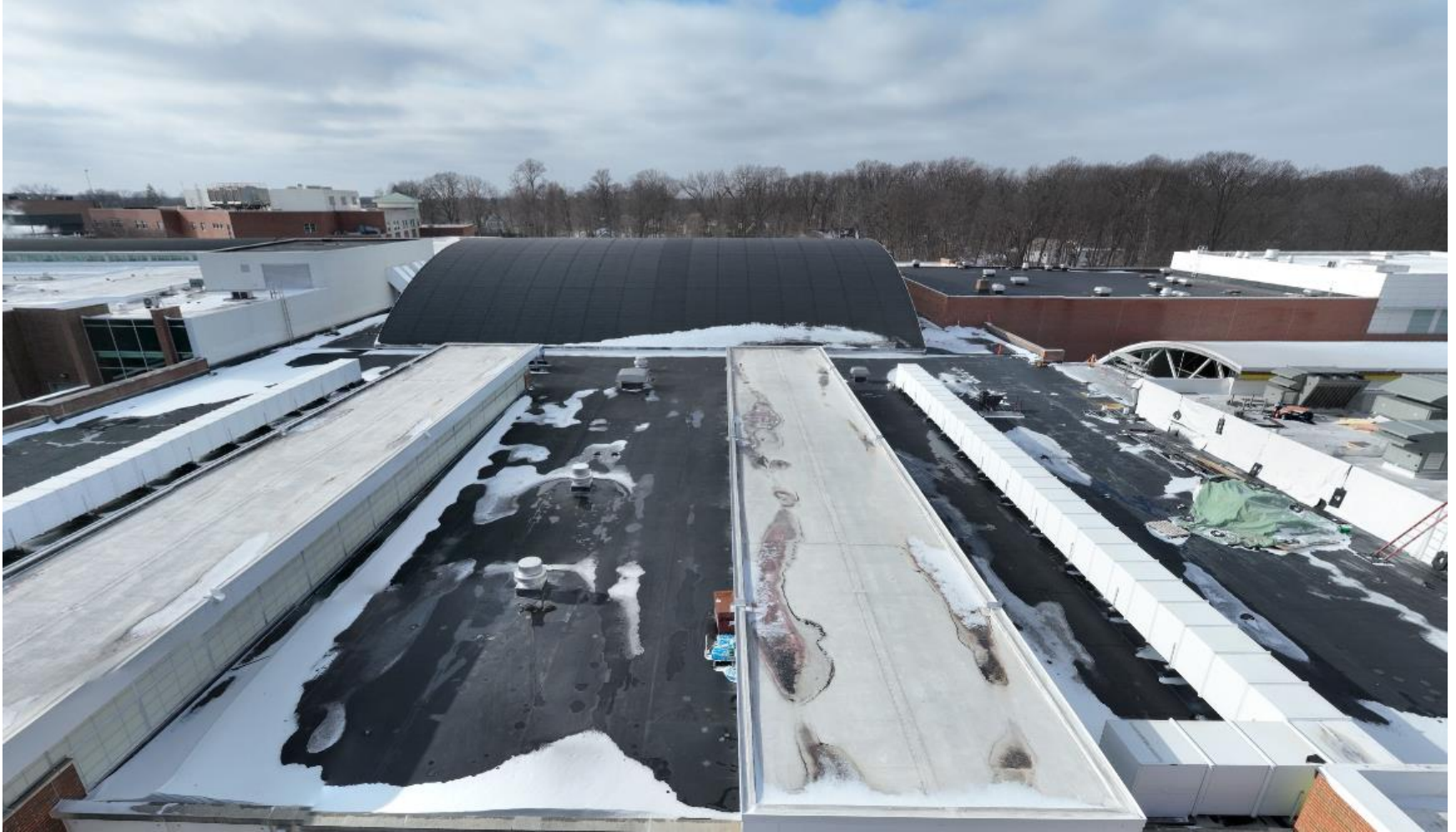
Carmel High School Existing Natatorium Re-Roof 520 East Main Street, Carmel, IN 46032